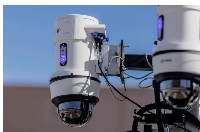
IR PTZ CAMERAS

There's multiple benefits of utilizing mobile surveillance units to support your parking lot security, specifically with LotGuard's Surveillance Trailers: