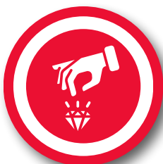
PERSONAL PROPERTY THEFT