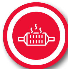
CATALYTIC CONVERTOR THEFT