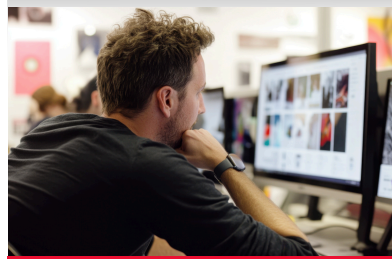
FREE VIEWING SOFTWARE